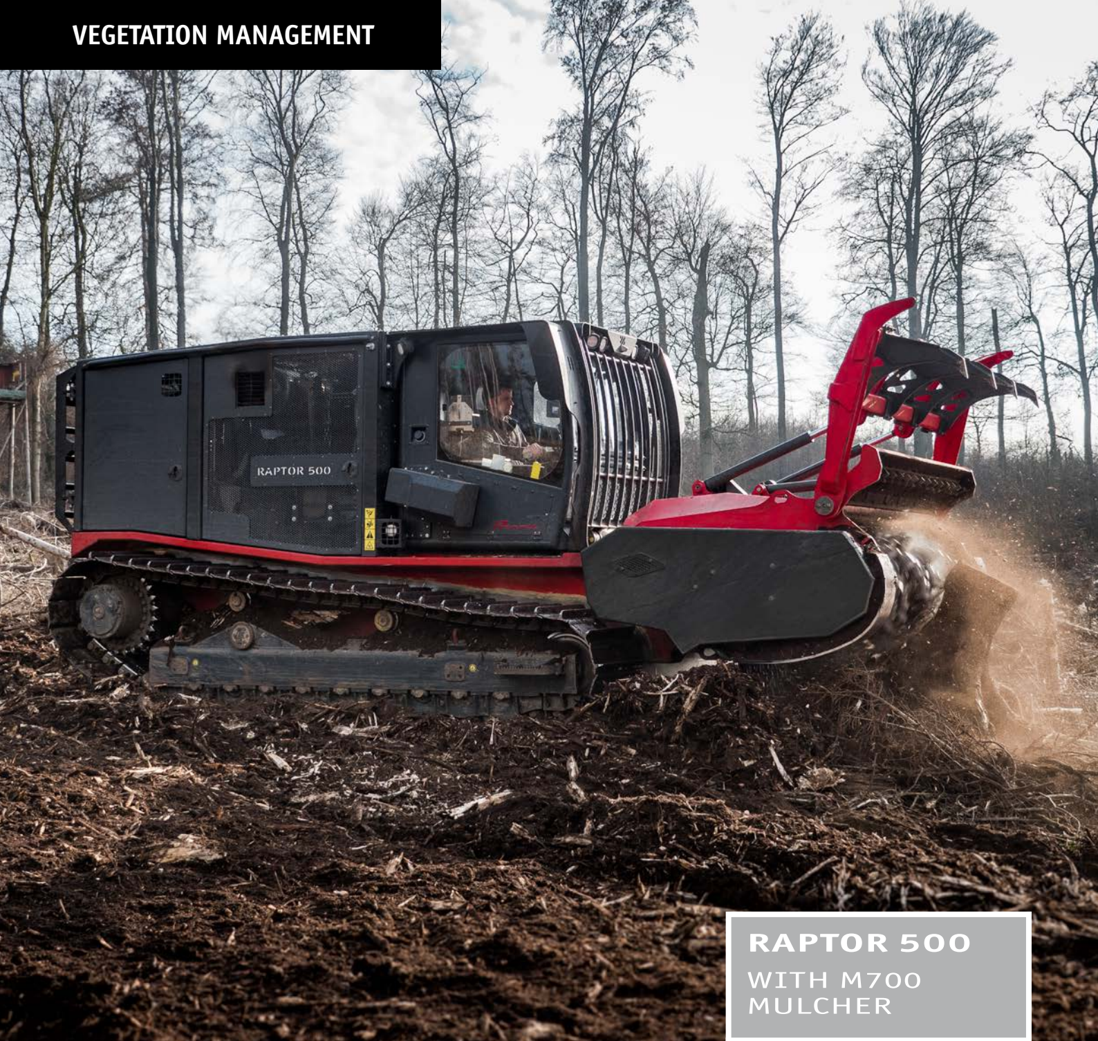
RAPTOR 500 WITH M700 MULCHER